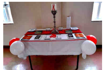
The awareness table prepared with educational pamphlets about Aids.

World Aids Day fell during the week so St Matthew's in KwaMagxaki held a World Aids Day Service on Sunday 5 December 2021. The theme was 'Working Together to End Inequalities'.